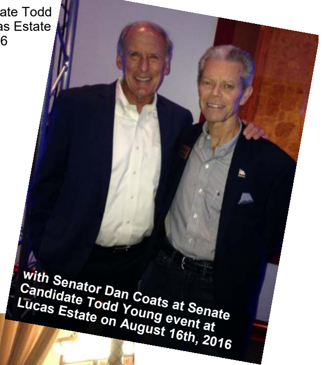
with Senator Dan Coats at Senate Candidate Todd Young event at Lucas Estate on August 16th, 2016