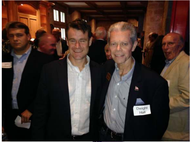
from Senate Candidate Todd Young event at Lucas Estate on August 16th, 2016