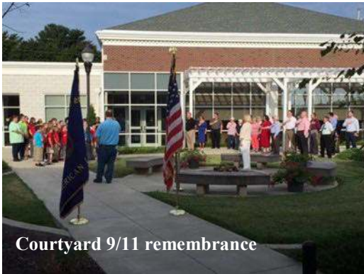
Courtyard 9/11 remembrance

Our next meeting will be held at the Mid America Science Park in Scottsburg on October 13th. This is now our permanent meeting place and we have a new meeting start time of 9:00 AM.