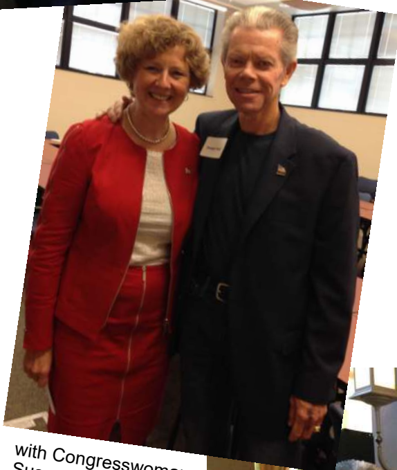
with Congresswoman Susan Brooks after participating in Health Care Forum in Noblesville on August 30th, 2016